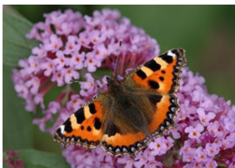
Small Tortoiseshell was recorded in 3 times as many squares as in 2012