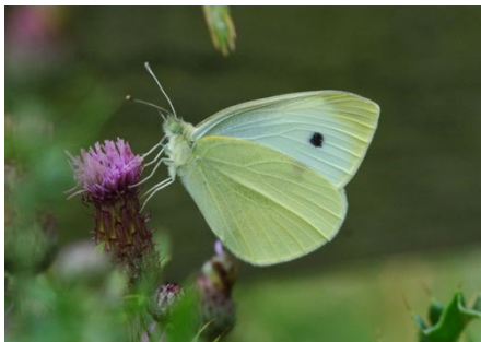
Small White was recorded in all squares